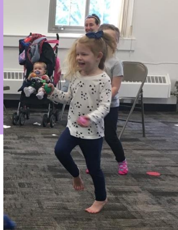
WORDS AND WIGGLES IS NEW FOR AGES 1-5

SUNDAY: Basketball Open Gym, Birthday Rentals